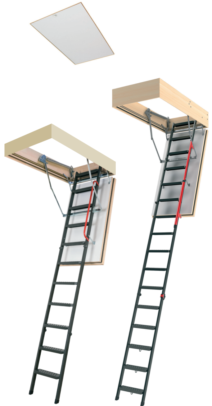
Version to room height 10'1"